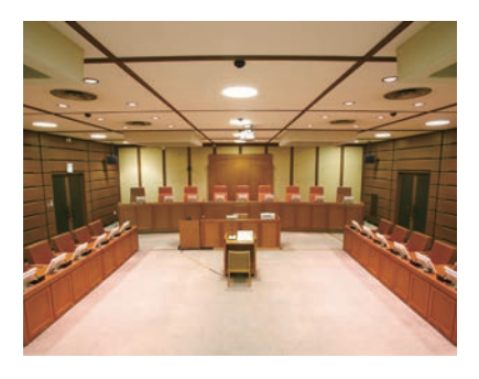
Ichigaya Campus Chuo Law School