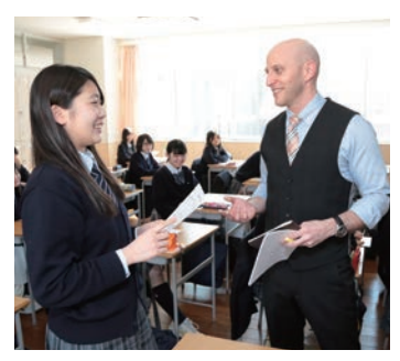
Class of English-Communication