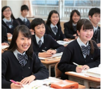
Junior High School

Among important extra-curricular activities are sports-teams and cultural clubs; these school clubs are administered by dedicated teachers and also supervised for by experienced coaches of each field.